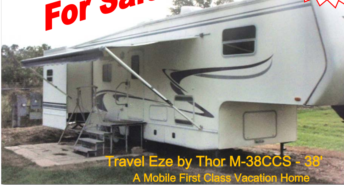
Travel Eze by Thor M-38CCS - 38' A Mobile First Class Vacation Home

Available for inspection daily (by appointment) at the Sun 'n Fun Fly-In campus, Lakeland (FL) Linder Regional Airport